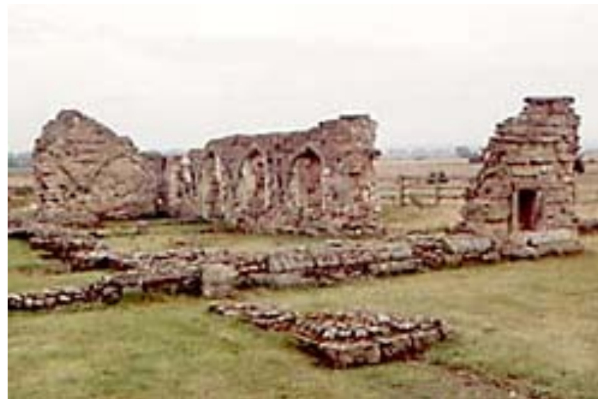
Mattersey Priory